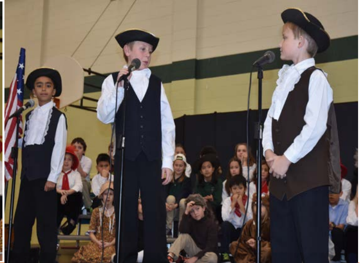
These pictures are of the All Saints School Fourth Grade Students performing their Grandfriends Day play about Oregon History: "My Oregon Report - A Musical". Grandfriends Day an annual school celebration, which was celebrated this year on Friday, November 17th, also included class visits and a brunch for the adults in the parish hall.